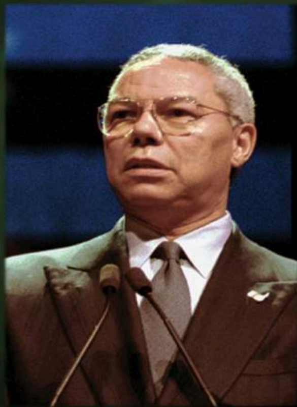
General Colin Powell

The day soldiers stop bringing you their problems, is the day they have either lost confidence that you can help or concluded you do not care. ”